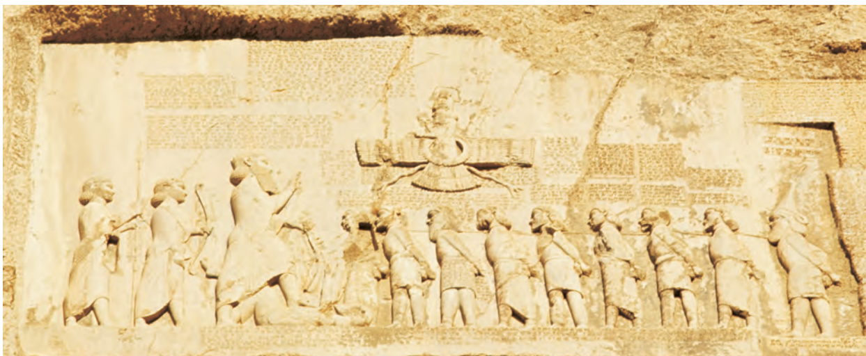
Darius faces Ahura Mazda, to whom he attributed his authority, as the various kings subject to him acknowledge him as their lord.