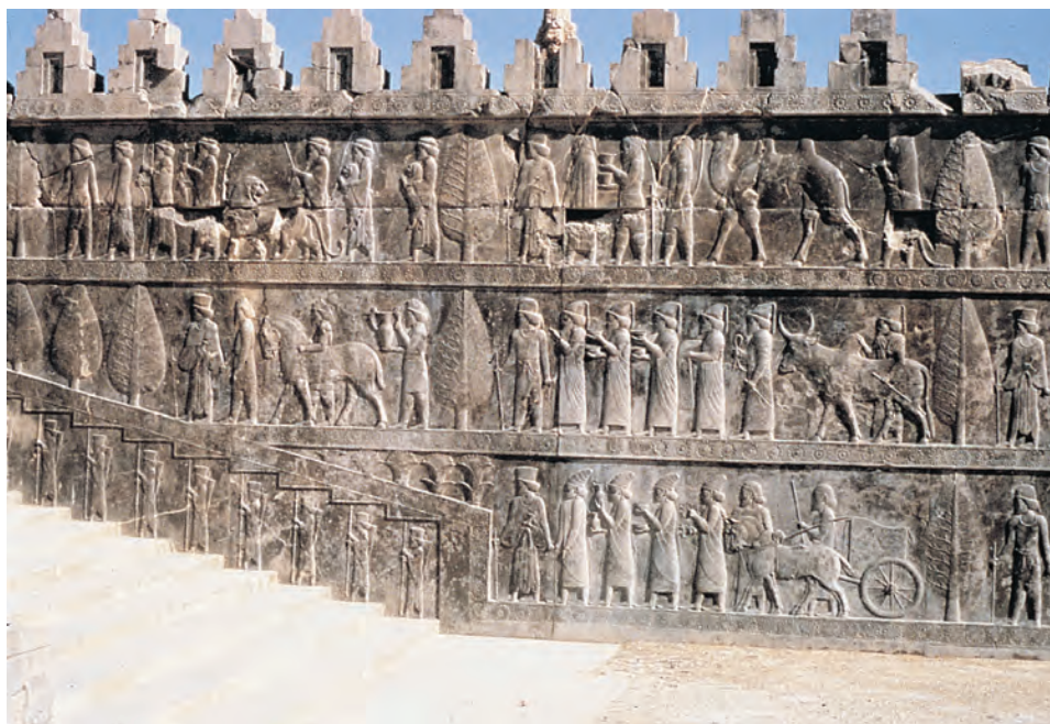
Tribute bearers from lands subject to Achaemenid rule bring rams, horses, and fabrics to the imperial court at Persepolis.

solid foundations for economic prosperity and secure transportation of trade goods. Trade benefited also from the invention of standardized coins, which first appeared in the Anatolian kingdom of Lydia. Beginning about 640 B.C.E. the kings of Lydia issued coins of precisely measured metal and guaranteed their value. It was much simpler for merchants to exchange standardized coins than to weigh ingots or bullion when transacting their business. As a result, standardized coins quickly became popular and drew merchants from distant lands to Lydian markets. When Cyrus defeated the forces of King Croesus and absorbed Lydia into his expanding realm, he brought the advantages of standardized coins to the larger Achaemenid empire. Markets opened in all the larger cities of the empire, and the largest cities, such as Babylon, also were home to banks and companies that invested in commercial ventures.