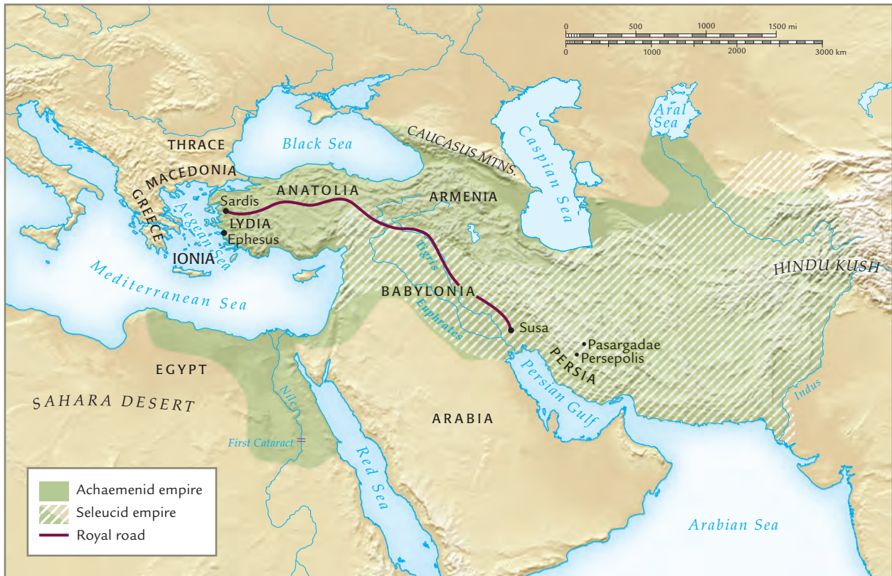
Map 7.1 The Achaemenid and Seleucid empires, 558–83 B.C.E. Compare the size of the Achaemenid empire to the earlier Mesopotamian and Egyptian empires discussed in chapters 2 and 3. What role did the Royal Road and other highways play in the maintenance of the Achaemenid empire?

in the sixth century B.C.E., the Medes and the Persians embarked on a vastly successful imperial venture of their own.