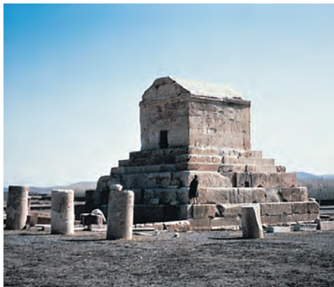
The tomb of Cyrus at Pasargadae—one of the few Achaemenid monuments that have survived to the present.

530 B.C.E. he fell, mortally wounded, while protecting his northeastern frontier from nomadic raiders. His troops recovered his body and placed it in a simple tomb, which still stands, that Cyrus had prepared for himself at his palace in Pasargadae.