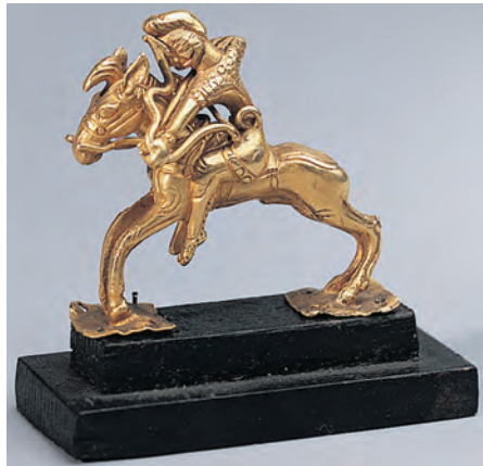
Gold sculpture of a nomadic horseman discharging an arrow. This figurine dates from the fifth or fourth century B.C.E. and might well represent a Parthian.

Once again, though, the tradition of imperial rule continued, this time under the Sasanids, who came from Persia and claimed direct descent from the Achaemenids.