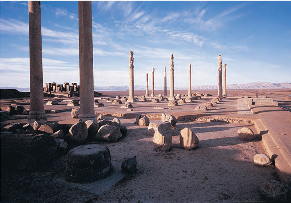
■ Ruins of Persepolis, showing the imperial reception hall and palaces.

appointed governors to serve as agents of the central administration and oversee affairs in the various regions. Darius divided his realm into twenty-three satrapies—administrative and taxation districts governed by satraps. Yet the Achaemenids did not try to push direct rule on their subjects: most of the satraps were Persians, but the Achaemenids recruited local officials to fill almost all administrative posts below the level of the satrap.