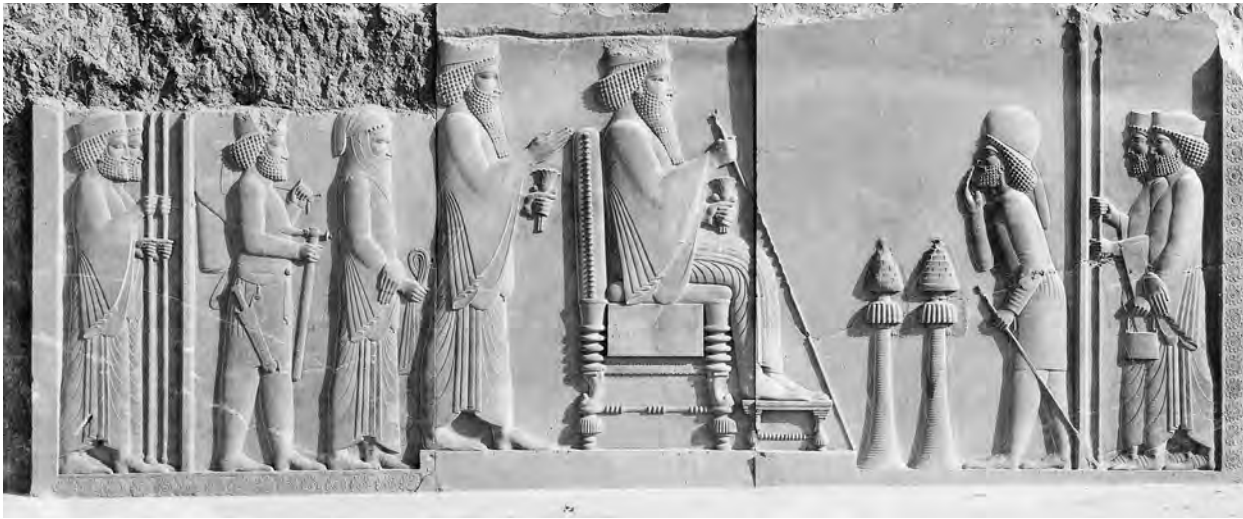
Carving from Persepolis showing an enthroned Darius (with his son Xerxes standing behind him) receiving a high court official, as incense burners perfume the air.

conquered lands. This policy caused enormous ill will, especially in Mesopotamia and Egypt where peoples with their own cultural traditions resented Xerxes' pretensions. Xerxes successfully repressed rebellions against his rule in Mesopotamia and Egypt. Yet resentment of Persian conquerors continued to fester, and it caused serious problems for the later Achaemenids as they tried to hold their empire together.