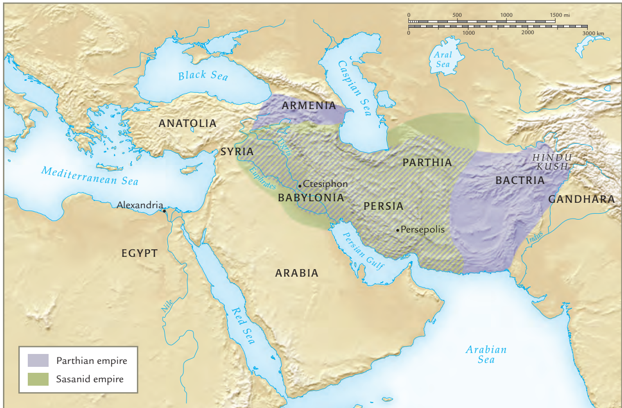
Map 7.2 The Parthian and Sasanid empires, 247 B.C.E.–651 C.E. Note the location of the Parthian and Sasanid empires between the Mediterranean Sea and northern India. What roles did these two empires play in facilitating or hindering communications between lands to their east and west?

Persian political and social affairs. Male warriors headed the clans, which retained much of their influence long after the establishment of the Achaemenid empire.