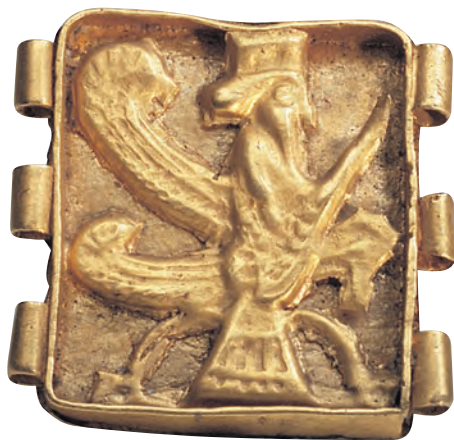
A gold clasp or button of the fifth century B.C.E. with the symbol of Ahura Mazda as a winged god.