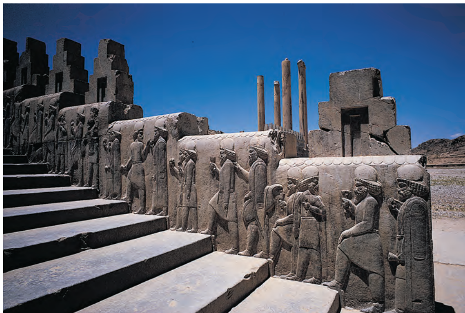
In this sculpture from Persepolis, Persian nobles dressed in fine cloaks and hats ascend the staircase leading to the imperial reception hall.

local temples, and they had the right to share in the income that temples generated from their agricultural operations and from craft industries such as textile production that the temples organized. The weaving of textiles was mostly the work of women, who received rations of grain, wine, beer, and sometimes meat from the imperial and temple workshops that employed them.