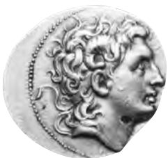
A coin issued by Alexander with an image of the conqueror.

cities were too small and disunited to pose a serious challenge to the enormous Persian empire. Meanwhile, for their part, the later Achaemenids had to concentrate on the other restive and sometimes rebellious regions of their empire and could not embark on new rounds of expansion.